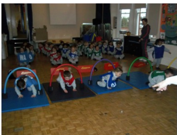
Through the tunnel