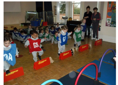
Over the hurdles