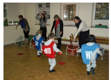
Balls in nets

We all had great fun and everybody won a medal!