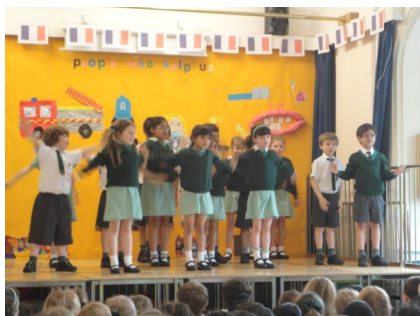
2A "The weather"

This week has seen some wonderful 'French Assemblies'. The children have been able to see what children from other classes have been learning and where their learning is taking them. French here at Oaklands is taught in a very practical and meaningful way. Year 3 taught us the French alphabet to a rap; Year 4 were able to give an excellent rendition of the French equivalent of 'Old Macdonald had a farm'; Year 5 performed some super scenes set in a French cafe and the Year 6 'Fashion show' was great. Tres bien, tout le monde!