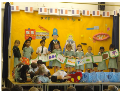
1T "The hungry caterpillar"