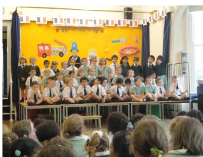
Transition "Our faces"