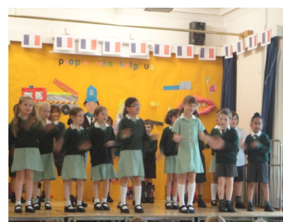
2C "Months of the year"