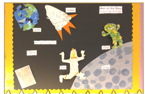
Reception Robins Display