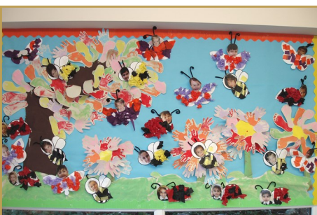
Lower Kindergarten Display

Since September, all the children that have joined Lower Kindergarten have made either a Ladybird, Butterfly or Bumblebee to represent the group they are in. They have used hand prints, scrunched paper and templates to make these lovely, colourful displays.