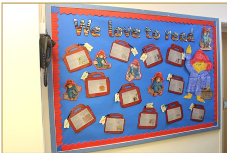
KS2 Reading Display

Everybody loves to read and we have been thinking about famous authors this term. KS1 enjoyed a lovely assembly about Eric Carle who wrote The Hungry Caterpillar and 10 Little Ducks. In KS2 the children found out about the life of Michael Bond and the creation of Paddington Bear. The children in KS2 have written some fabulous reviews about books by their favourite authors for our reading display and to share their love of these authors with their friends.