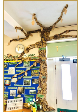
Year 6 Display

Year 6 have been focusing on their creative writing and how to improve and up-level their descriptions of a setting. They looked at Sherwood Forest, the home of the famous outlaw, Robin Hood. All the children did a fantastic job at describing the setting, using their senses, imagination and creative word banks. Please feel free to visit Year 6 to read their amazing descriptions.