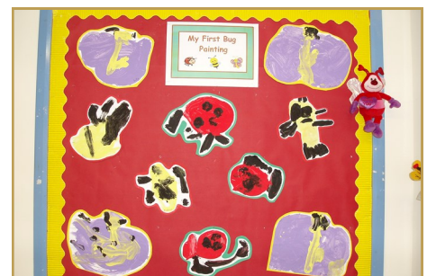
Lower Kindergarten Display

Since September, all the children that have joined Lower Kindergarten have made either a Ladybird, Butterfly or Bumblebee to represent the group they are in. They have used hand prints, scrunched paper and templates to make these lovely, colourful displays.