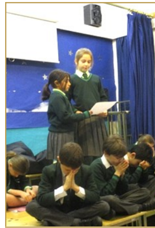
Year 5Z leading Assembly

everyone how to look after their physical wellbeing through food, being active and getting enough sleep. They also emphasized the importance of looking after our minds. Children all through the school worked on a wide range of activities which focused on feeling better about ourselves, having a positive outlook and being healthier individuals. This included sharing positive thoughts with others, developing strategies