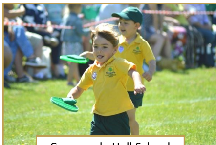
Coopersale Hall School

the turn of Upper Kindergarten who took part in lots of fun races and enjoyed competing. Reception, Years 1 and 2 pupils took part in obstacle races, under and over races, bat and beanbag races and flat races. Finally in the afternoon it was the turn of the Juniors where each year group took it in turns to earn points for their House