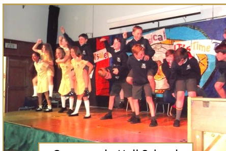
Coopersale Hall School

The end of the Summer Term always marks an emotional time for our oldest pupils as they come to leave. Year 6 pupils from Coopersale Hall and Oakland are moving on to their chosen secondary schools, while Year 11s from Braeside and Normanhurst are moving on to further education.