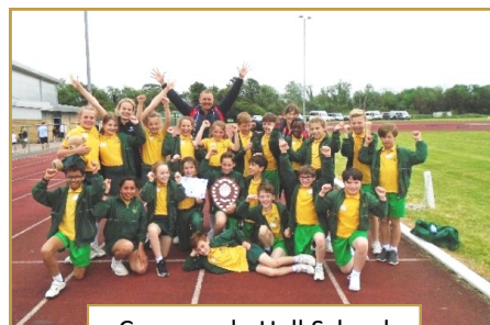
Coopersale Hall School

The ISA Athletics event was a particular highlight, with pupils from both Normanhurst and Braeside making it to the National finals at The Alexander Stadium. A few Coopersale Hall pupils took part in the Epping and Ongar District Athletics Tournament where they successfully took home the District Athletics Shield. From Oaklands, the children who attend Athletics Club took the trip to Lee Valley Athletics Centre for an afternoon of specialist coaching from two professional athletes.