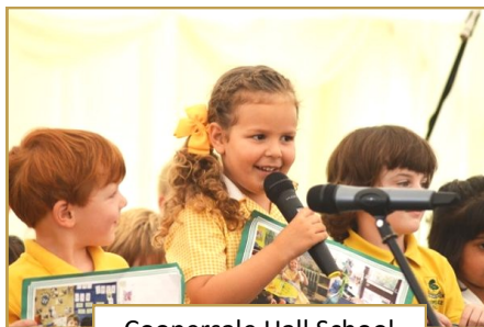
Coopersale Hall School

The children at Coopersale Hall also entertained with songs, with favourites being 'If I Were a Minibeast'