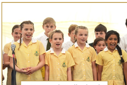
Coopersale Hall School

Each school had a guest speaker who not only spoke about their role, but also helped to present the prizes.