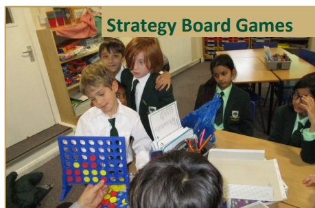
Strategy Board Games

All our extracurricular clubs are incredibly popular with the children and are consistently well attended. Besides providing additional learning opportunities in a wide range of activities for the children, they also help develop each child's personal confidence and social skills as they interact with different children and other staff of the school.